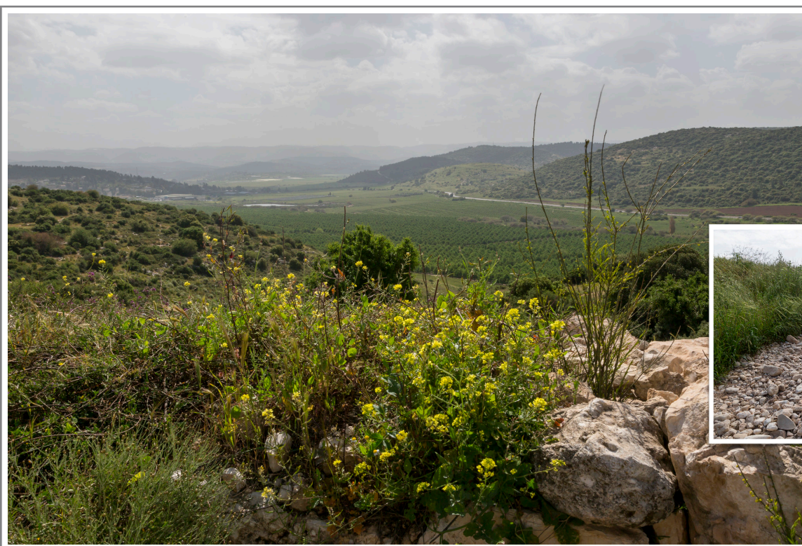
(Above, left, below) The Valley of Elah, where David fought Goliath. There is a dry creek bed running through it.