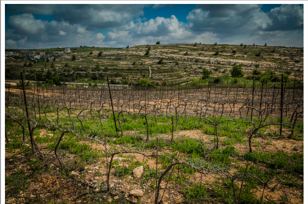
(left and above) Modern-Day Gibeah

(Right) Some beautiful children we encountered in March 2015 - Jewish children living in the West Bank near Mizpah. The red hair made me think of David, called “ruddy”, in 1 Samuel 16:12.