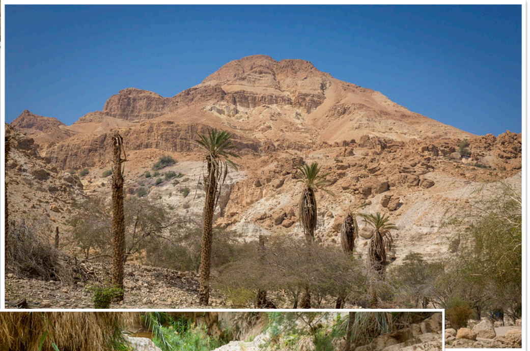
(Right, below) En Gedi, also a place of escape for David mentioned in 1 Samuel 23:29 and 1 Samuel 24:1