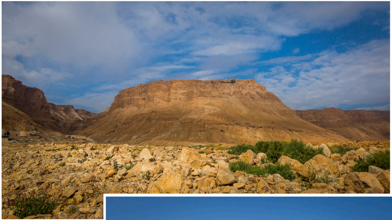
(Above) Masada, likely the wilderness “stronghold” and hiding place of David mentioned in 1 Samuel 22:4, 5 and 23:14