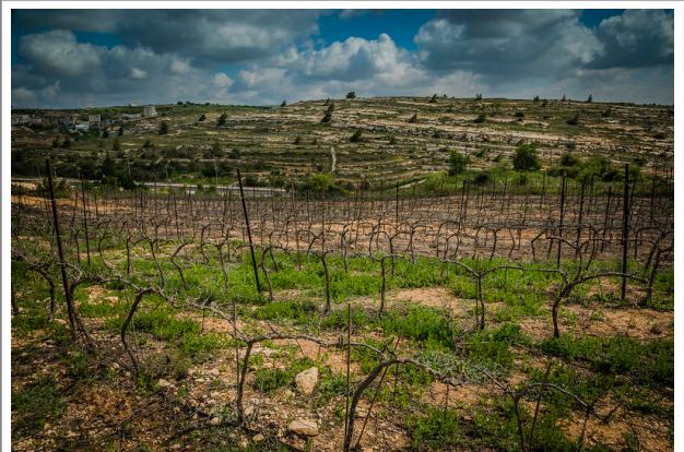
(left and above) Near modern-day Gibeah

(Right) Some beautiful children we encountered in March 2015 - Jewish children living in the West Bank near Mizpah. The red hair made me think of David, called “ruddy”, in 1 Samuel 16:12.